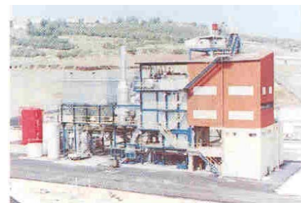
FIG 2: General view of the boiler and associated equipment.

The boiler was commissioned with a John Thompson two bank mild steel bare tube economizer equipped with sootblowers. After commissioning it was found that when burning substandard fuels fouling factors were higher than anticipated and a third economizer bank was added. This provides additional protection for the bag filter which has an operating temperature limitation.