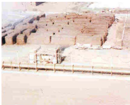
FIG 1: Fuel handling plant showing the debaler and open air storage of bales.

Cotton stalks left after cotton harvesting are uprooted and shredded mechanically. This material, which has a moisture content of about 60%, is transported in a trailer to a large mobile baling press. The bales measuring approximately 3m x 3m x 7m are stored in the field. During storage moisture content drops to between 30% and 40% after one or two weeks and to as low as 15% after a few months. At this moisture content, the bales which are now ready to be burnt have a mass of about 100 tons. Bales have been stored satisfactorily in this way for up to 2 years.