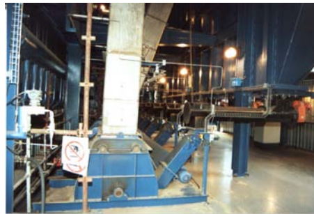
Bagasse & Coal Feeding System

A stoker is only part of a complex combustion system comprising fuel feeders, spreaders, and primary and secondary air systems. It is necessary to consider all of these components and their interaction when optimizing the performance of a boiler.