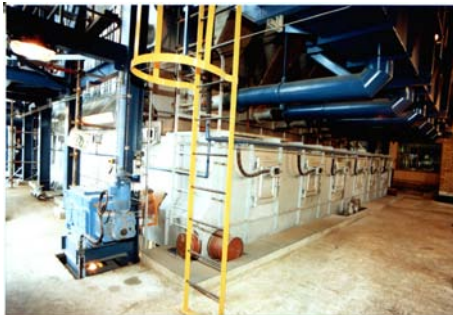
Front of 150 t/h Coal/Bagasse Fired Boiler

Undergrate zoning is incorporated to facilitate the control and distribution of primary air across the length of the stoker. This consists of a series of small, self-cleaning hoppers each fitted with a damper capable of being adjusted whilst the boiler is on line. An arrangement of a typical zoned stoker is given on the front page.