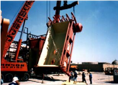
Erection of Furnace Front Module

In November 1996, Caltex Refinery, Milnerton, RSA placed an order with JTB for the supply and installation of an Oil and Gas Fired Watertube Boiler as part of the Refinery upgrade project. During negotiations much emphasis was placed on the environmental aspects and the boiler was designed to comply with European standards. The unit was commissioned in January 1998 and successfully attained all performance and environmental guarantees.