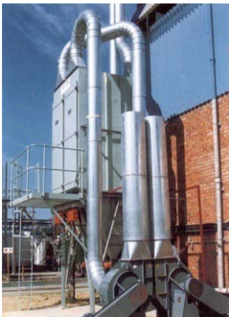
Filcomatic Flat Panel Reverse Pulse Filter