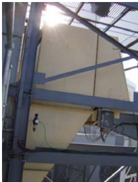
Insertable filter on a bucket elevator