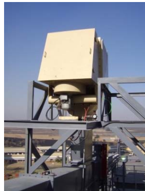
Insertable filter on conveyor