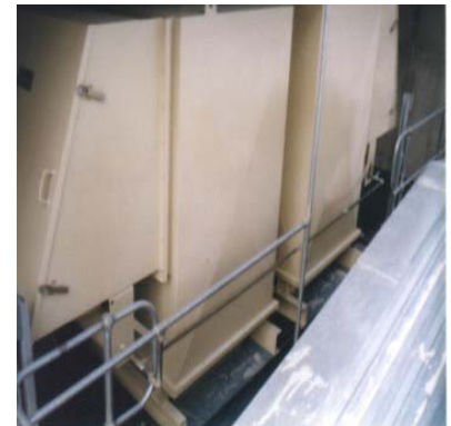
2 x FMI 20 F3, each serving a conveyor transfer