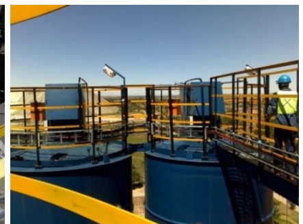
Flat Bag insertable filters silo vents