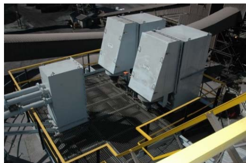
Flat Bag Insertable Filters pneumatic conveying